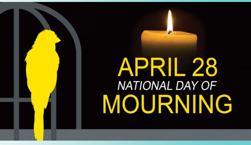
CUPE 523 Ad in the Penticton herald April 2022

cupe Local 523 remembers those who have lost their lives, injured, or suffered illness on the job and are committed to stand together to create safer workplaces.