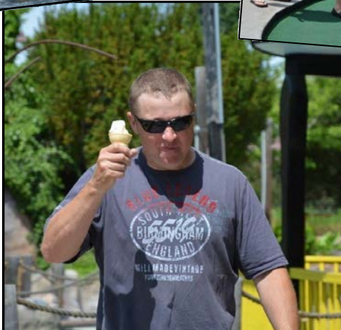
& loads of smiles with Unit SD67