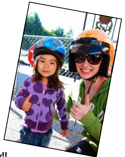
Unit SD83, It was a Wonderful day!! 105 people attended....Lots of fun had by all!