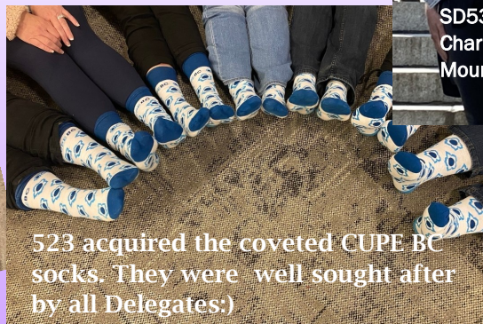
523 acquired the coveted CUPE BC socks. They were well sought after by all Delegates:)